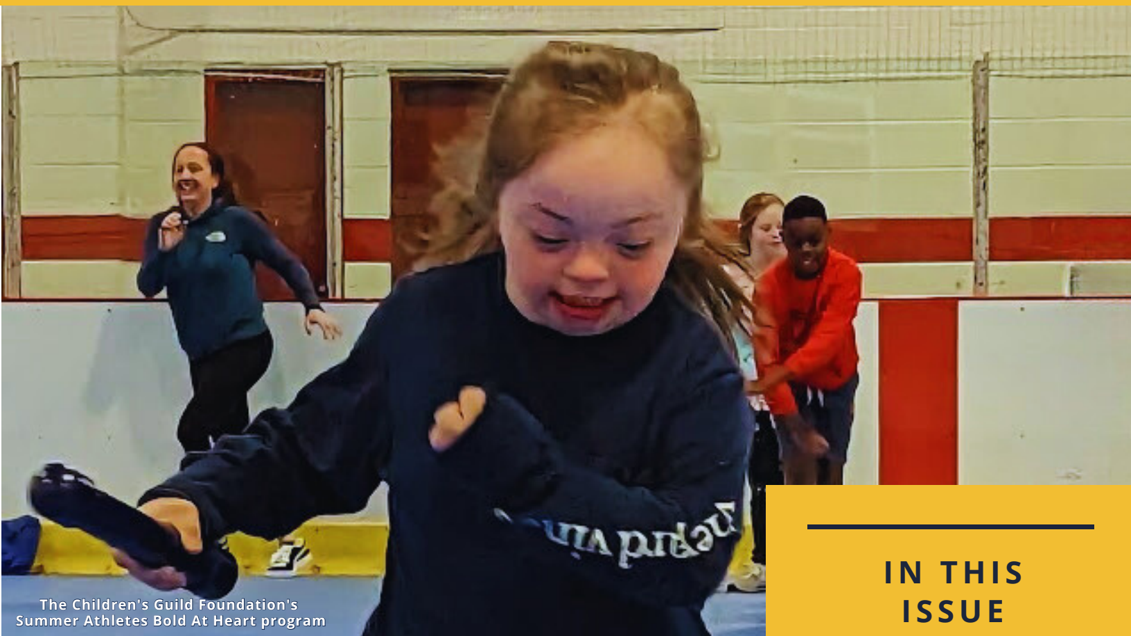
The Children's Guild Foundation's Summer Athletes Bold At Heart program